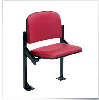
SC padded tip-up

available in a range of colours to suit your club branding