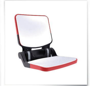
BS premium tip-up

cost effective seating solution available in a range of colours