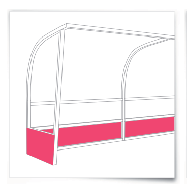
low level cladding suitable for hockey dugouts for extra protection.

our bespoke padded vinyl's fix to the portable dugout framework front crossbar and/or side uprights and are a great addition to any dugout, ideal for sponsor logos and thank you messages These can be ordered at the same time as your football dugout order or at a later date.