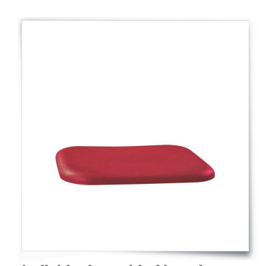
individual moulded bench

high quality finish with multiple colour options and club/ sponsor logo options