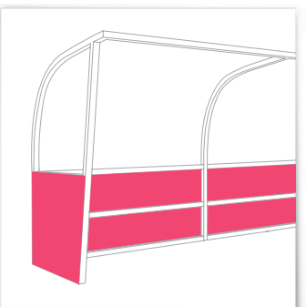
high level cladding suitable for hockey dugouts for additional extra protection.