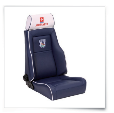
SS1 customised sports seat

range of colours with various customisation options, club/sponsor logo options