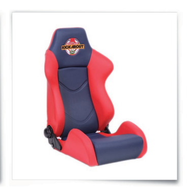
SS2 customised sports seat

padded tip-up seat, with choice of colours and club/ sponsor logo options